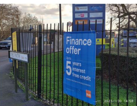
After February 2023