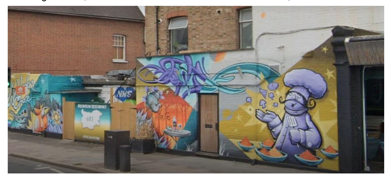
Before-Advertisement of restaurant

Officers visited the property and discussed with the owner and staff of the restaurant, after negotiations, it was moved via informal enforcement action, the results are below.