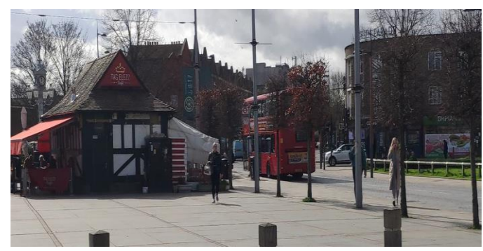
After -1 week later